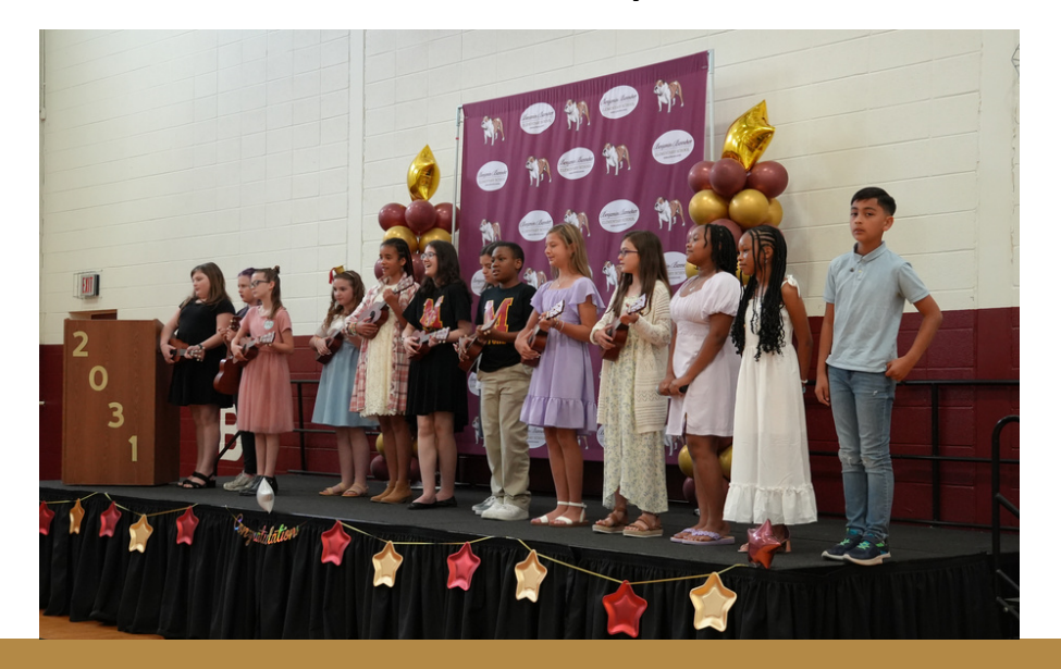
Banneker 5th Grade Students Perform during their 5th Grade Ceremony

We believe honoring each individual's identity, opinions, and dignity leads to a sense of belonging for each member of the school community.