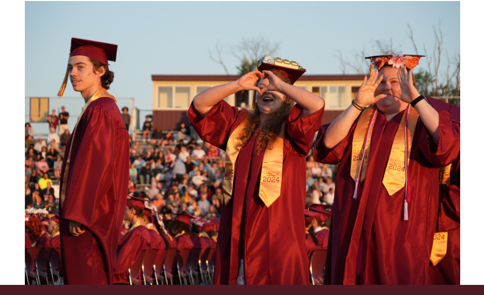
MHS Senior Graduate, celebrated by families and the greater district-community.

We believe the district's partnerships with families and community are integral to the success of our students and community at large.