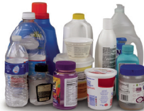
BOTTLES, JARS, JUGS, AND TUBS Empty and replace cap