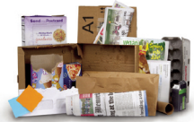
MIXED PAPER, MAGAZINES, NEWSPAPER AND BOXES Empty and flatten