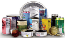
FOOD AND BEVERAGE CANS Empty and rinse