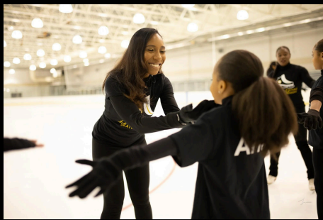
Figure Skating in Detroit Opportunity:

As figure Skating in Detroit is growing and opportunities for girls are increasing, we want to always include the New Paradigm girls as much as possible. Any girls ages 14 -24 who are interested in working our GDYT FSD Summer Program and are a Detroit resident, should visit the site. We are recruiting now. Spaces are limited. For more information visit