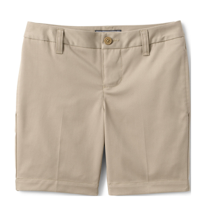
Khaki Shorts Top of the Knee-Length