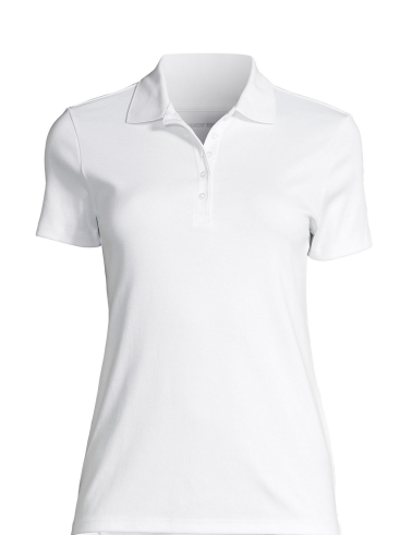
White Polo Shirt Long or Short Sleeve