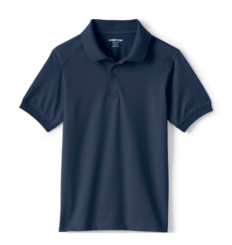
Navy Polo Shirt Long or Short Sleeve