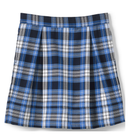
Plaid Skort Nands' End Only Item #528165-AL8