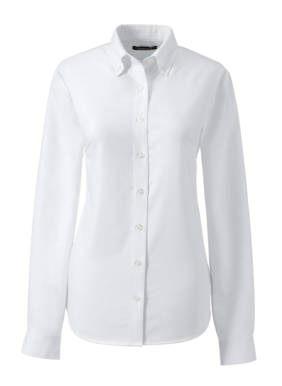
White Oxford Dress Shirt Long Sleeve Only