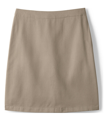
Khaki Skort Top of the Knee-Length