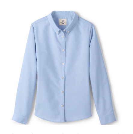
Sky Blue Oxford Dress Shirt Long or Short Sleeve