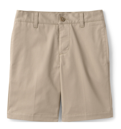
Khaki Shorts Top of the Knee-Length