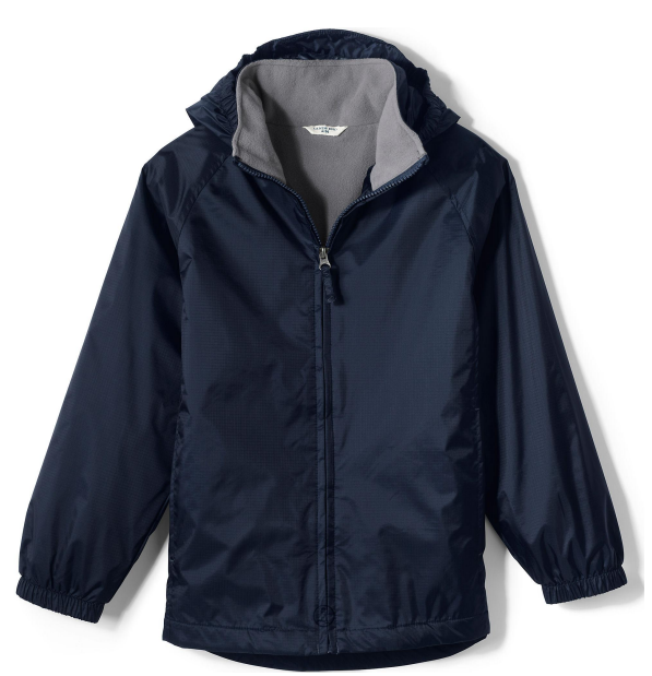
Jacket (Navy, or Black)