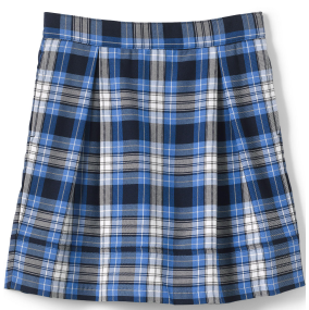
Plaid Skort Lands' End Only Item #528165-AL8