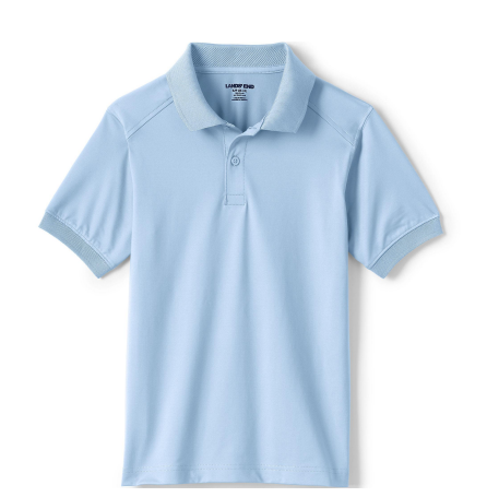
Sky Blue Polo Shirt Long or Short Sleeve