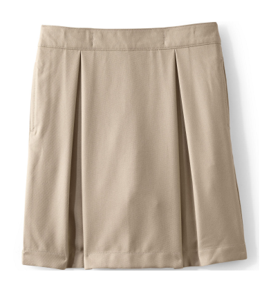
Khaki Skort Top of the Knee-Length