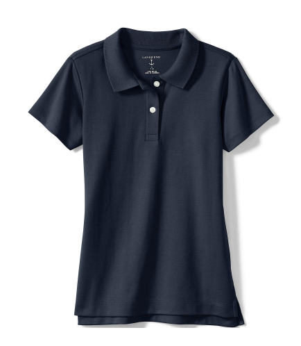
Navy Polo Shirt Long or Short Sleeve