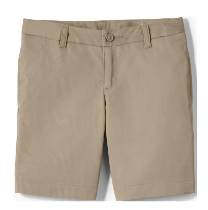
Khaki Shorts Top of the Knee-Length