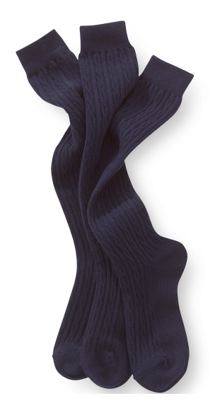
Socks (Black, White, Navy)