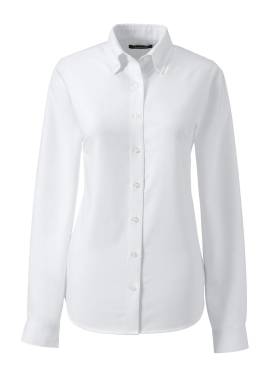
White Oxford Dress Shirt Long or Short Sleeve