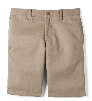
Khaki Shorts Top of the Knee-Length