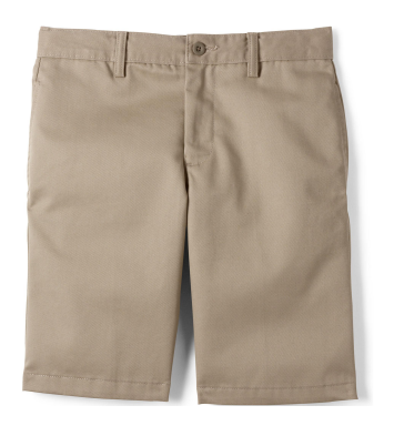
Khaki Shorts Top of the Knee-Length