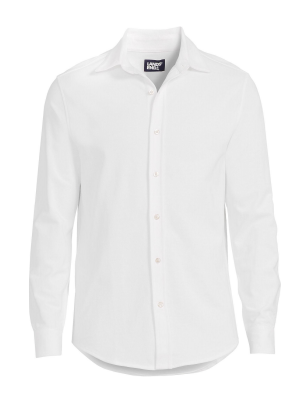
White Oxford Dress Shirt Khaki Bottoms Long Sleeve Only