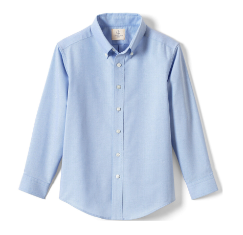
Sky Blue Oxford Dress Shirt Long or Short Sleeve