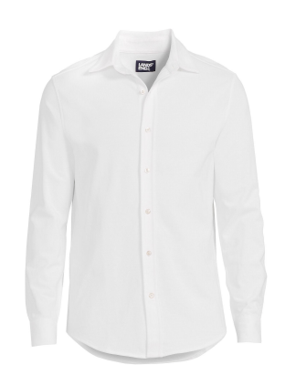
White Oxford Dress Shirt Long or Short Sleeve