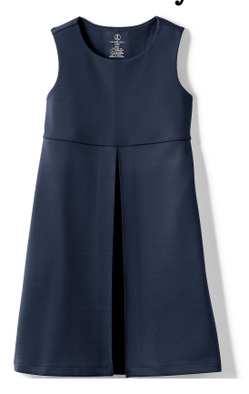
Sleeveless Navy Ponte Jumper