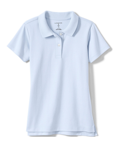
Sky Blue Polo Shirt Long or Short Sleeve