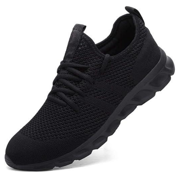
Shoes (Black, Brown, Navy)