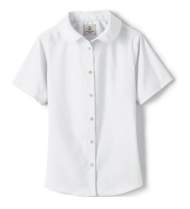
White "Peter Pan" Shirt