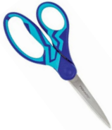
1 pair of scissors