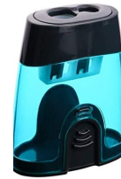
1 handheld manual pencil sharpener that catches shavings-no battery operated sharpeners please