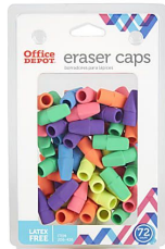
1 pack of pencil cap erasers