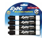
4 pack black Expo dry erase markers