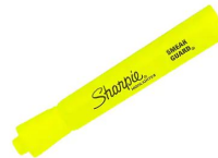
1 yellow highlighter