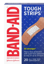
1 box of band aids