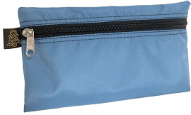
1 soft-sided pencil pouch to hold supplies