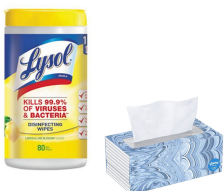
1 container of antibacterial wipes and 1 box of kleenex