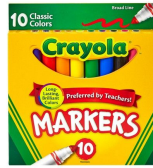
1 box of 10 count Crayola markers-- Classic Colors