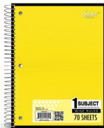
2 wide ruled one-subject notebook