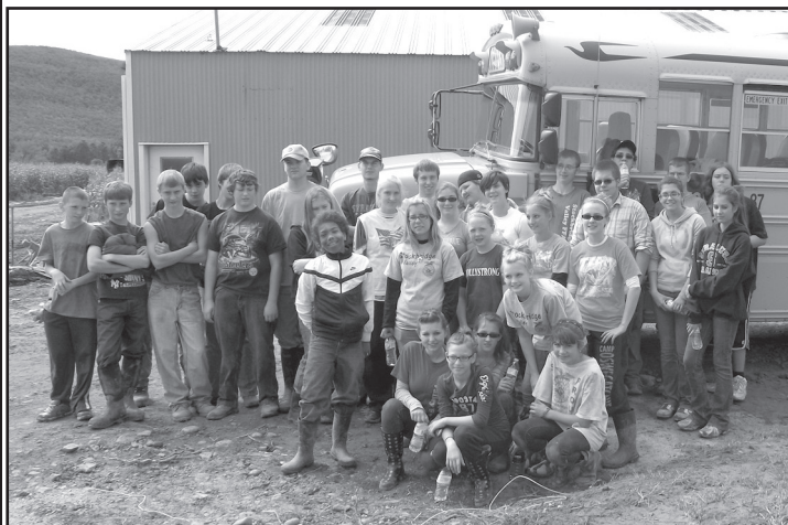
FFA members and students of Stockbridge Valley.

Students from Stockbridge Valley and members of the FFA went to Schoharie County to help with the clean up from Hurricane Irene. We spent the first two Saturday's of the new school year, September 10 th and 17 th volunteering our time. The first weekend, 24 kids and 6 adults went and the second weekend, 31 kids and 3 adults attended. Hurricane Irene did major damage to Schoharie County, although no one was hurt or killed. As we approached the scene we looked out the windows to see the water line on the houses. Many of the houses had to get torn down! Imagine how these people must have felt.