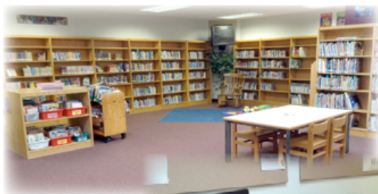
At left: New look to the Elementary side of the Library with a new story time rug and SMARTBoard®.

All classes are off to a great start listening to some fun stories, learning to navigate the Library, and checking out books. The Pre-K and Kindergarten are learning proper book care and listening to books by Eric Carle. The 3 rd Graders are learning about the Dewey Decimal System and 5 th & 6 th Grade are learning to use our library catalog OPALS and other library databases for research.