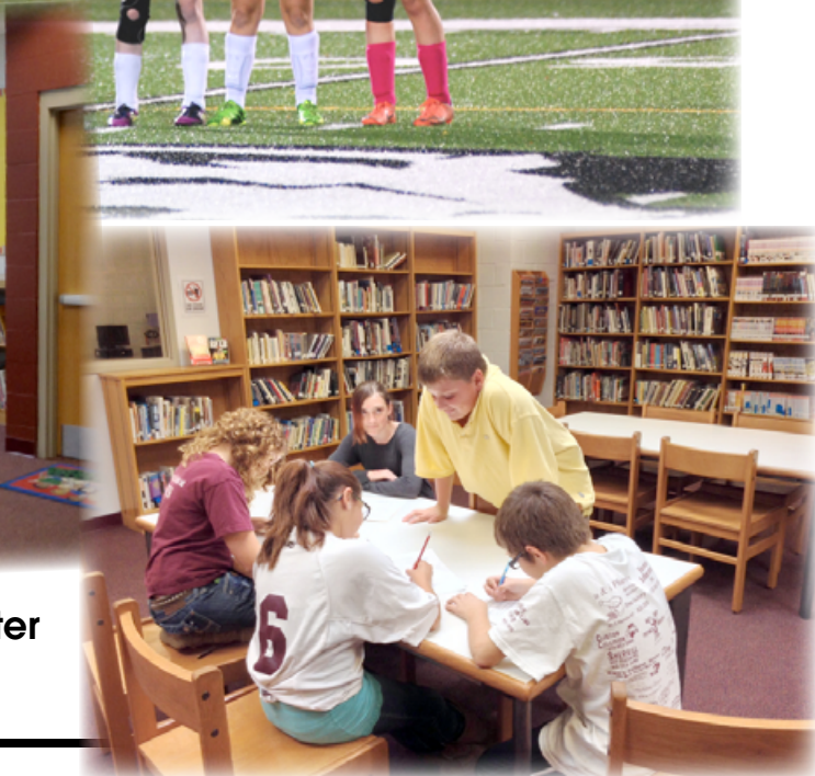
Upgraded Library/Media Center