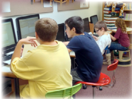
At right: Some students of the 7 th Grade LMS Class using NoodleTools and working on their research projects.

The 7 th and 8 th Graders are working on a research project re: a topic of their choice. Students have learned how to narrow a topic; find sources using OPALS, Library databases and search engines; and cite those sources using NoodleTools. Our next steps are to take notes and save them on NoodleTools, create an outline, and begin writing our papers!