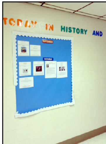
Left: Students display their "Today in History" mini-research projects outside of the Library