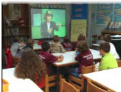
Introduction to the Dewey Decimal System in 3 rd grade.