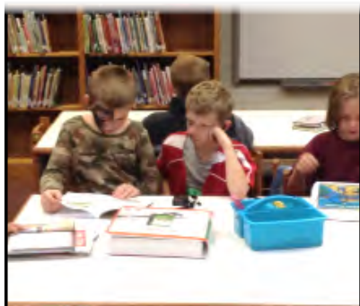
Friends discovering a great audiobook!