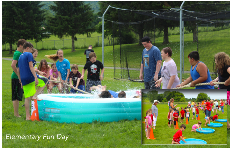
Elementary Fun Day