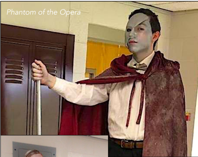
Phantom of the Opera