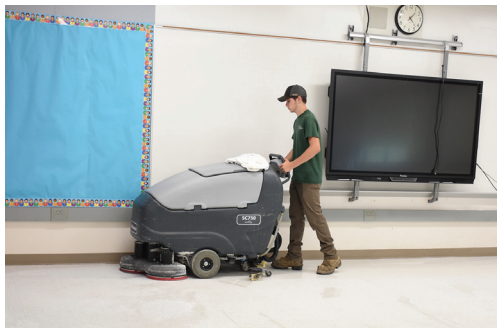
Maintenance staff and SVCS student cleaners have been hard at work getting the school ready for the return of our students on September 7th!