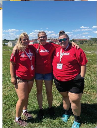
FFA summer activities