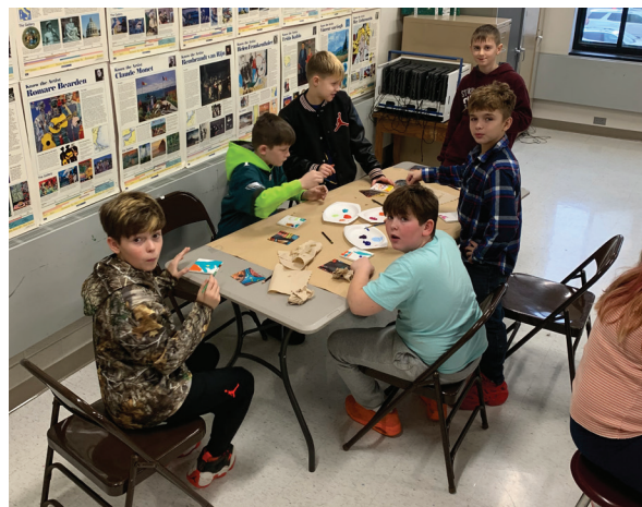
Students participate in Wellness Day