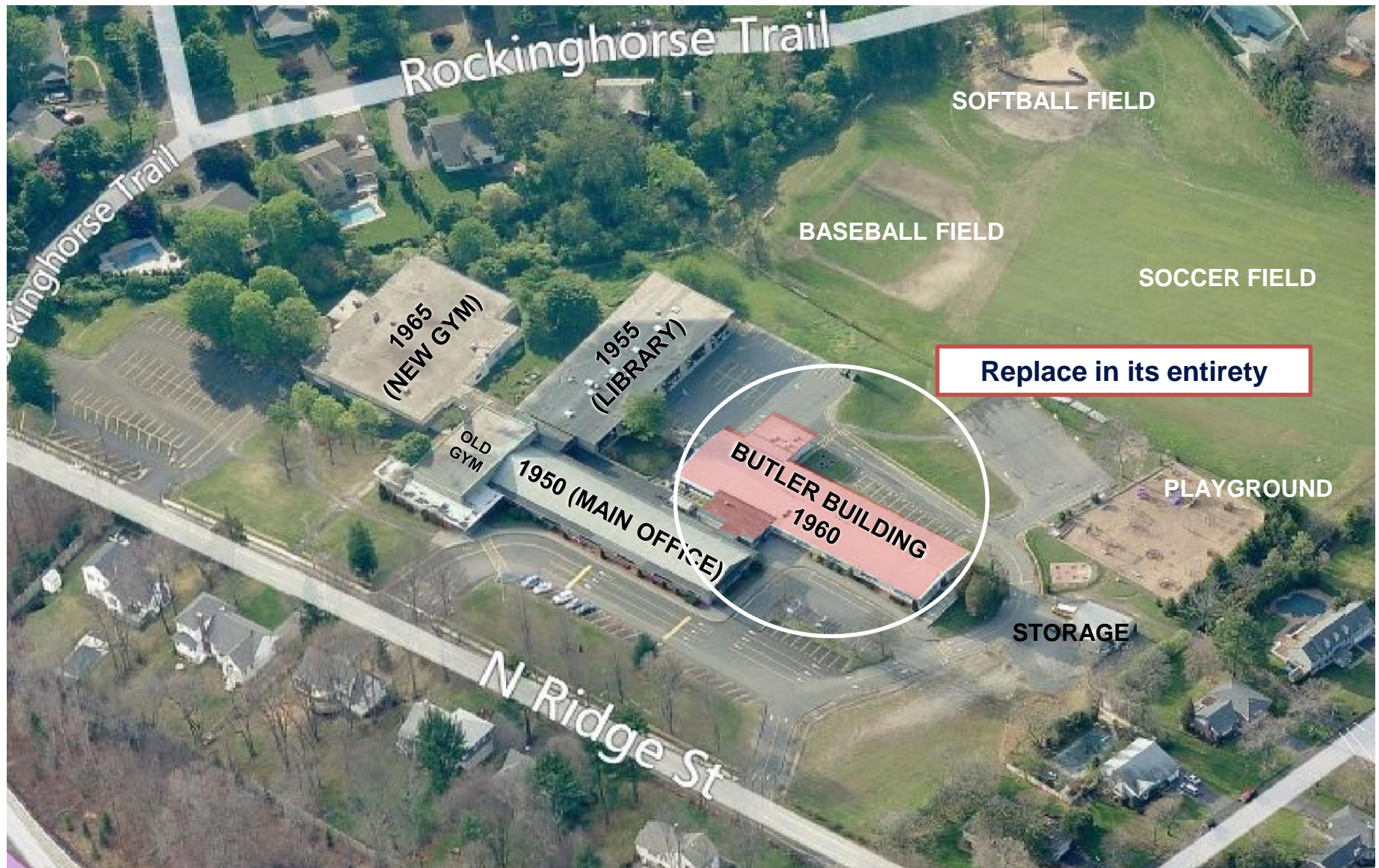
Ridge Street School, Existing Site Plan