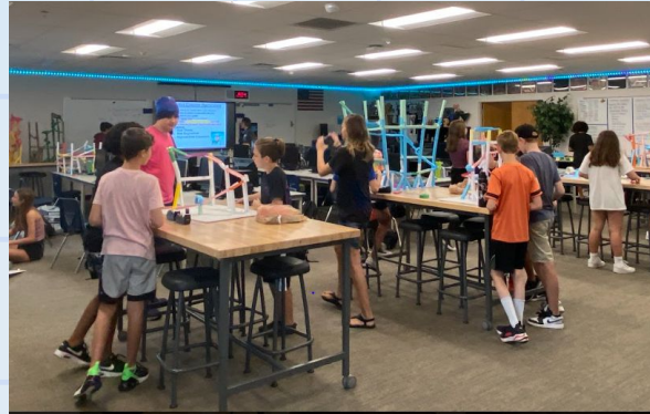
Career Action Lab Medical STEM