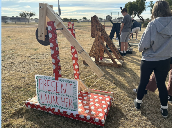
STEM - Engineering Focus