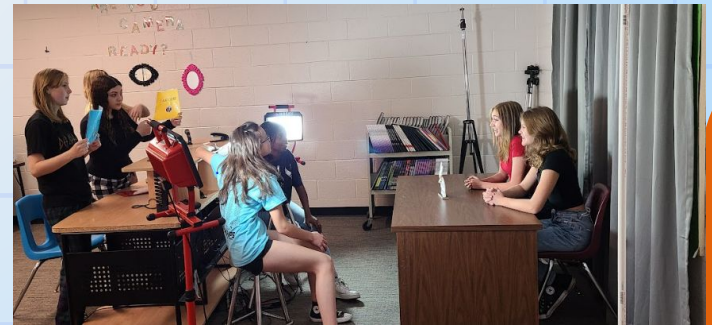
Creative Publications - Announcement Class