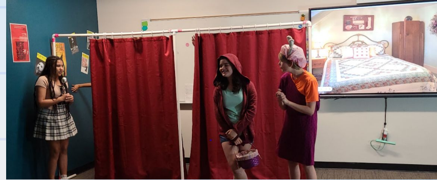
Performance and Literary Works - Drama Class