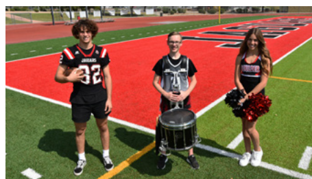
NEW Turf Fields