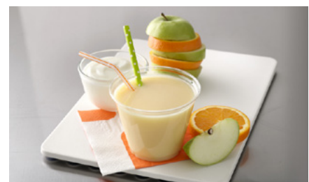
PG2 Sweet Treat