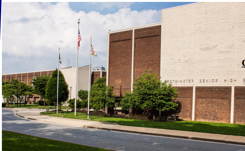
Photo identification is required of all visitors.