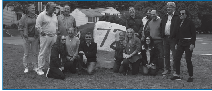
RNHS class of '72 painted the rock to celebrate their 50th reunion