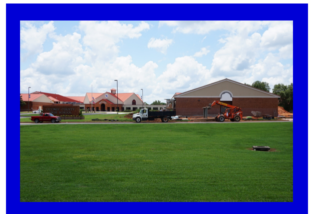
Oconee County High School 20-classroom addition