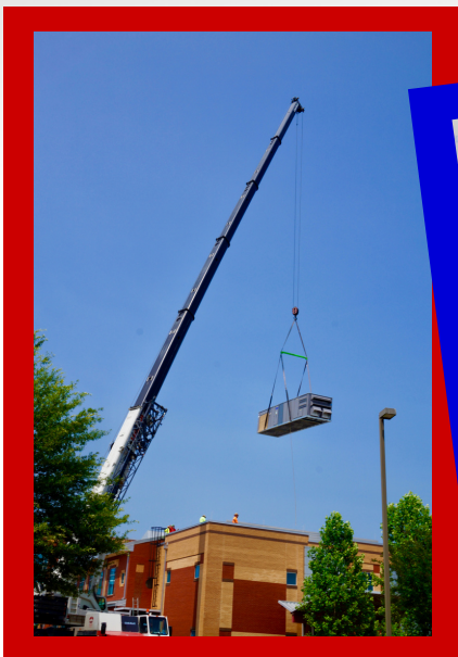
HVAC at Oconee County High School and North Oconee High School