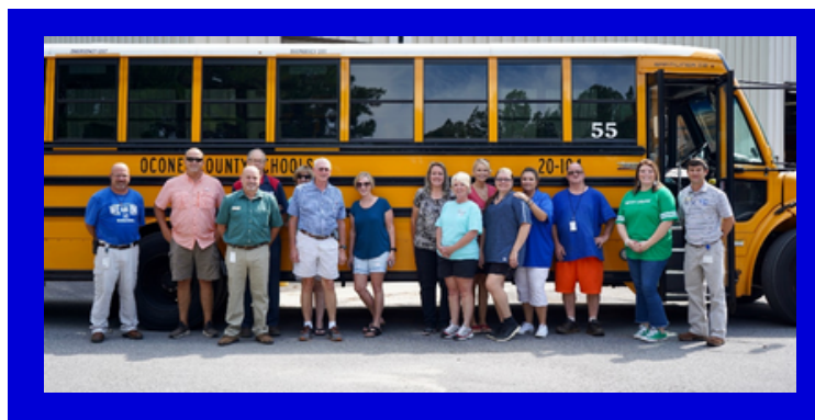
New buses with air conditioning