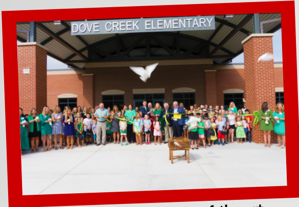
Newly-constructed state-of-the-art Dove Creek Elementary School