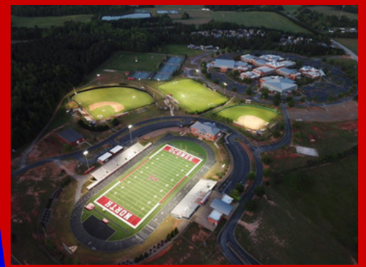
Artificial turf, track, and lighting at Oconee County High School and North Oconee High School