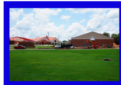
Oconee County High School 20-classroom addition