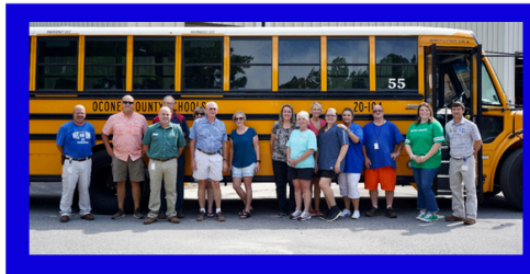
New buses with air conditioning