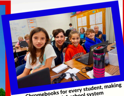
Chromebooks for every student, making OCS a 1:1 school system