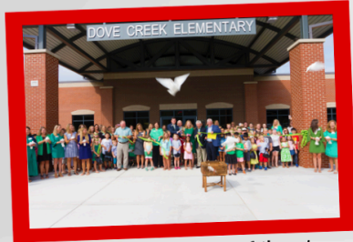
Newly-constructed state-of-the-art Dove Creek Elementary School

ELOST V SUPPORTED THE FOLLOWING PROJECTS FOR OUR STUDENTS: