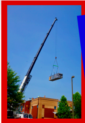
HVAC at Oconee County High School and North Oconee High School