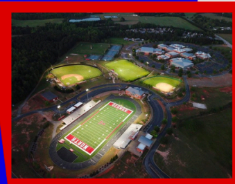
Artificial turf, track, and lighting at Oconee County High School and North Oconee High School