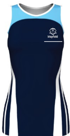
Tape on the outside