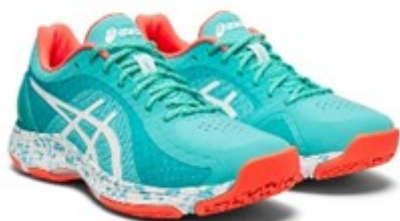
Trainers for Running/Netball - examples

n.b. Fashion trainers or flyknits are not permitted sport footwear.