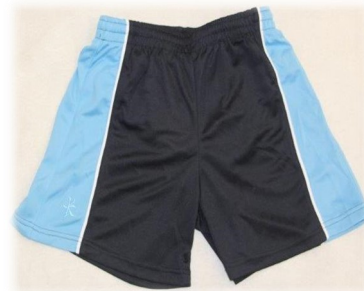
Tape on the outside