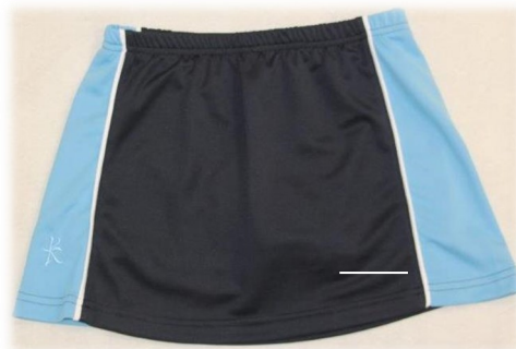
Tape on the outside