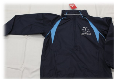
Tape inside neck band