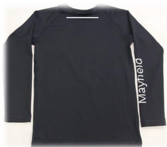
Tape inside neck band