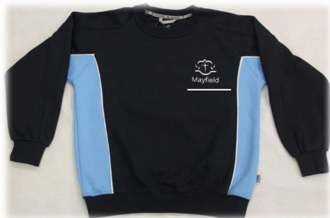
Tape on the outside