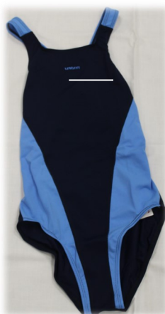
Tape on the outside