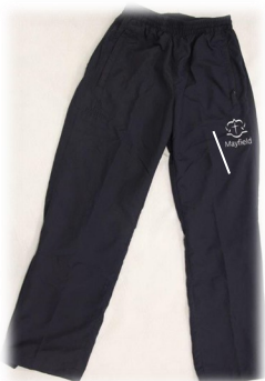
Tape on the outside