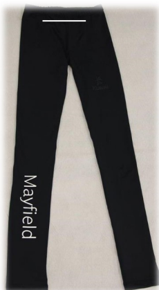
Tape inside waist band