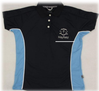
Tape on the outside