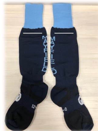
Tape on the outside

The white line shows the position for the name tape