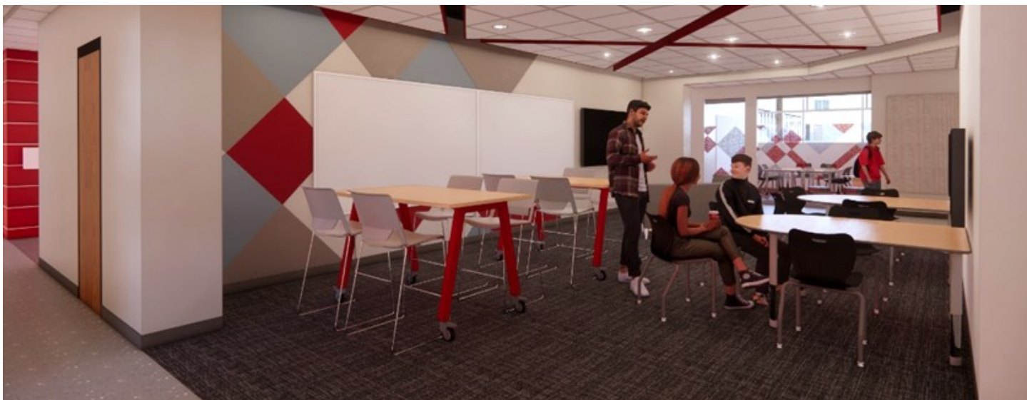
From top: Renderings of main entry, two-story link addition, flexible learning space