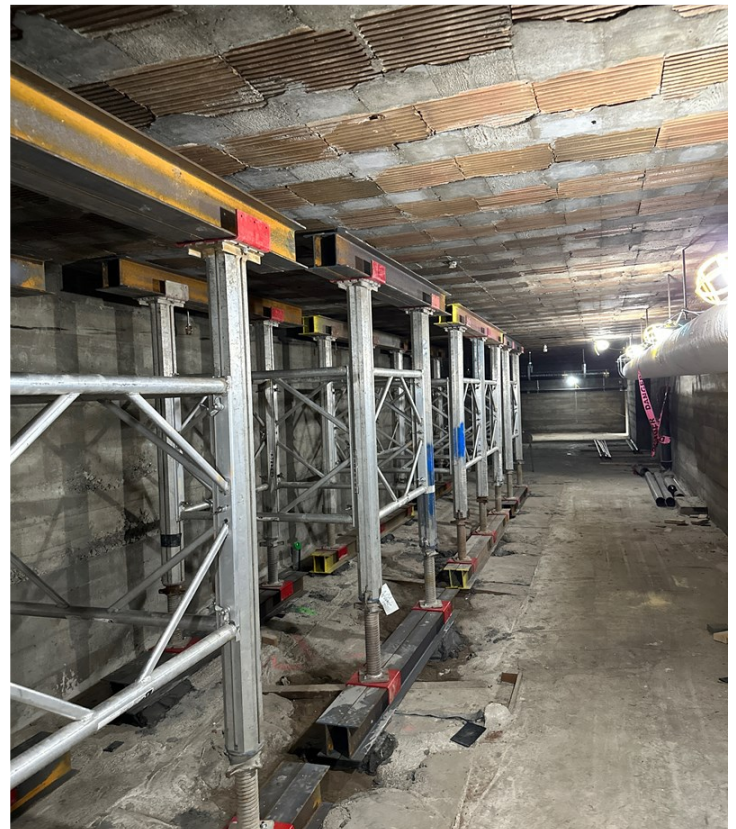
From the top: Prepping for earthwork near Webster Park; middle school connection addition; basement shoring (May 2024)