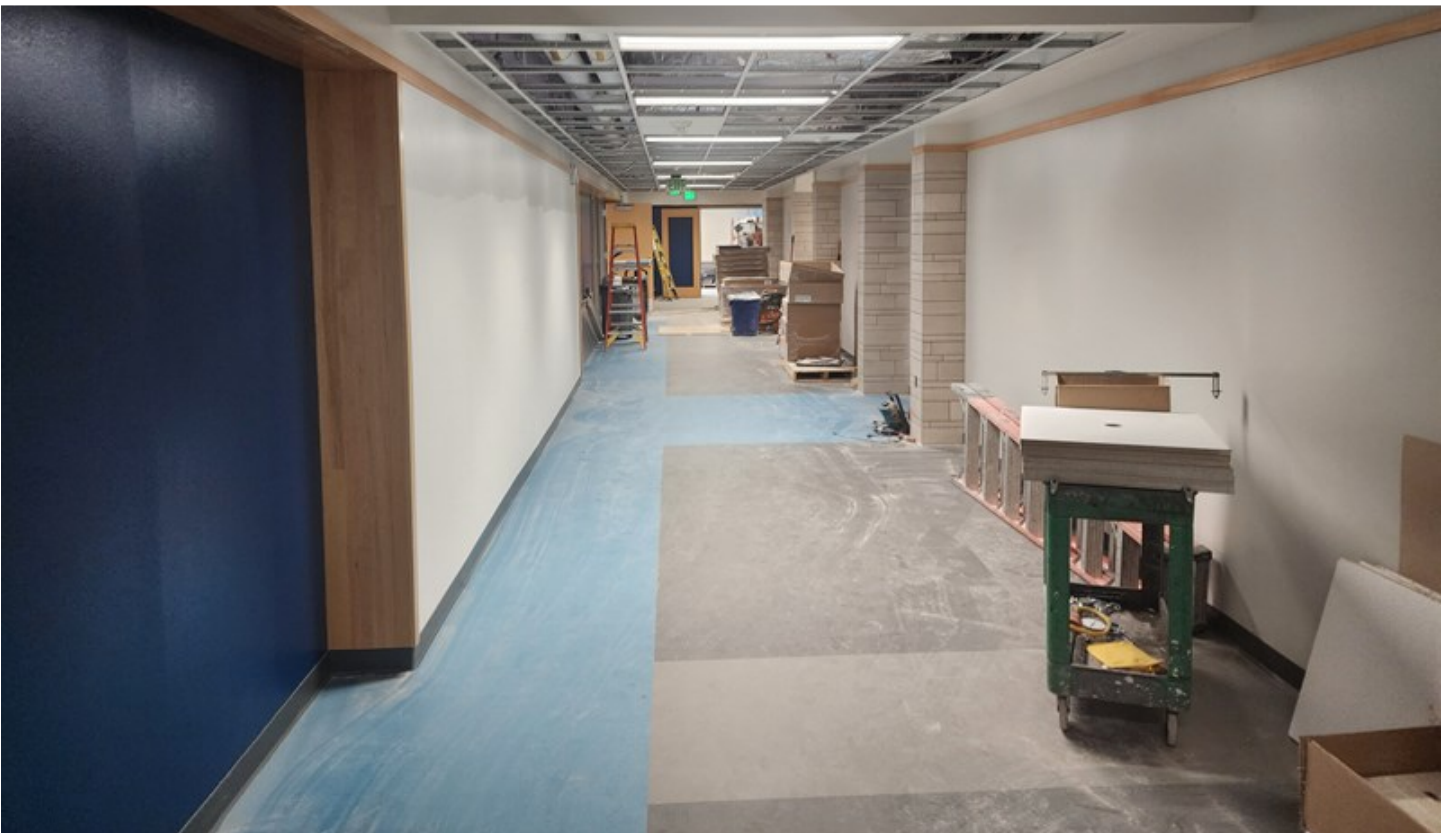
From top: First-floor classroom renovation; first-floor renovated hallway (May 2024)