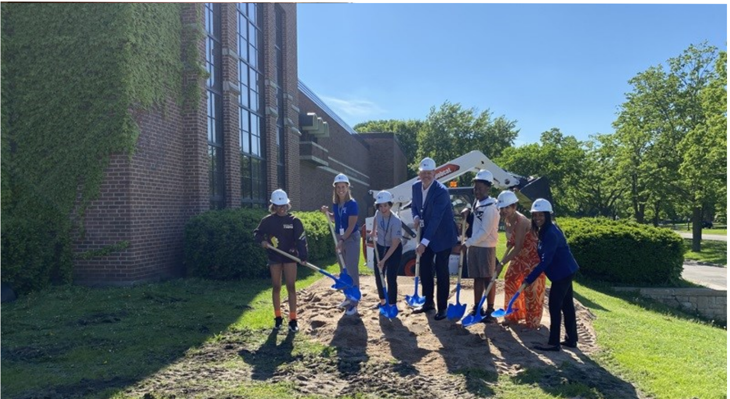
From top, at Wilson: Cafeteria ready for installation of grilles in soffit and wall; new flooring, wall, paint and light fixtures in classroom; doorframe installed for secure main entry; new flooring and existing furniture reinstalled in main office; May 23 groundbreaking celebration at Hidden River (May 2024)