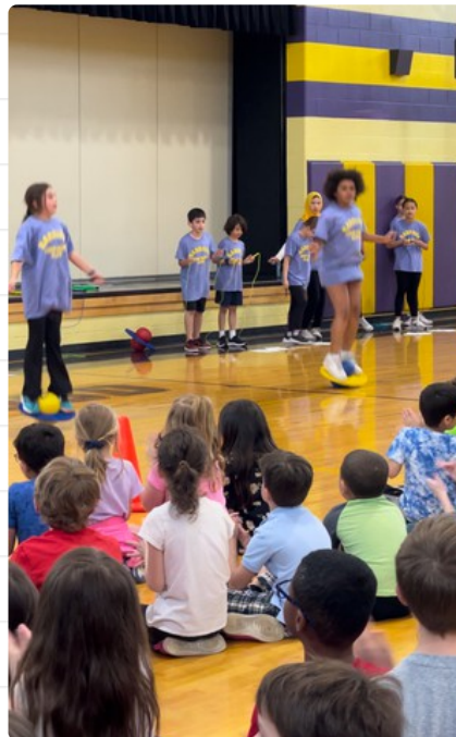
Jump Rope Club Showcase