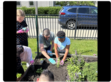
Harrison Garden Club