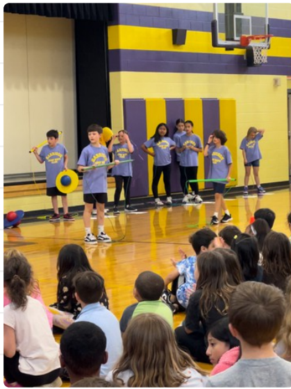
Jump Rope Club Showcase