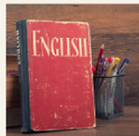
AP, Honors, CP English IV