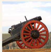
AP & Honors US History II