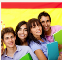
Honors Spanish IV