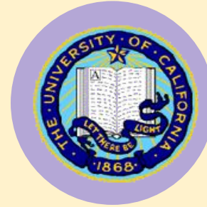
University of California (UC)

CSU East Bay San Francisco State Sacramento State