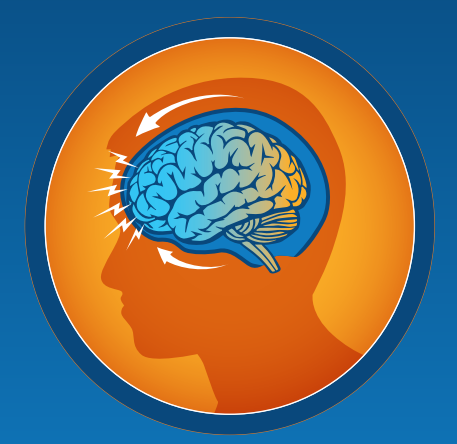
The head and brain to move quickly back and forth.

A concussion is a type of traumatic brain injury from a bump, blow, or jolt to the head or body that causes: