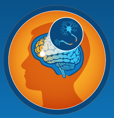
Chemical changes in the brain, and sometimes stretching and damage to the brain cells.