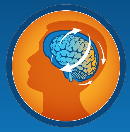
The brain to bounce or twist in the skull from this sudden movement.