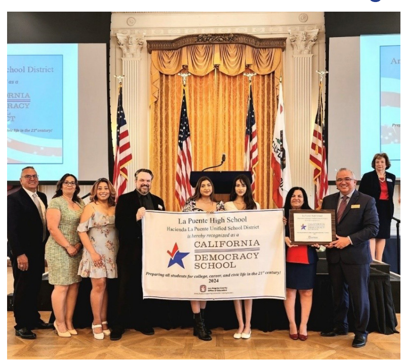
La Puente High School was named a 2024 California Democracy School during the Los Angeles County Office of Education's California Civic Learning Student Showcase and Award Ceremony on May 11.

La Puente High School is one of only four schools recognized as a 2024 California Democracy School by the Los Angeles County Office of Education (LACOE), receiving the honor for its high-quality civic learning, commitment to strengthening democracy, and pursuit of happiness for future generations across the District community.