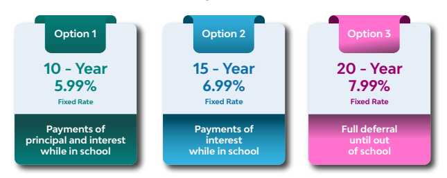
*Additional .25% interest rate reduction with an automatic recurring monthly repayment plan of principal and interest. Subject to the availability of funds. www.njclass.org