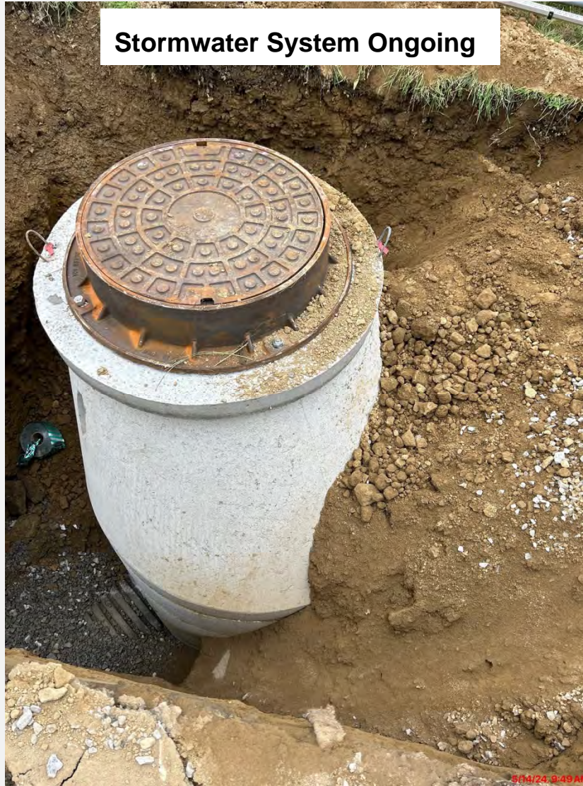
Stormwater System Ongoing