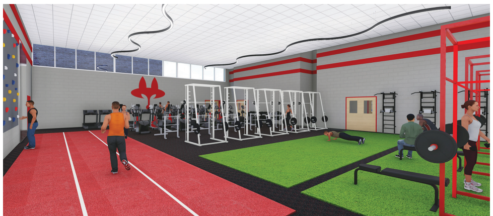
FOX LANE HIGH SCHOOL WELLNESS CENTER

For more information on the bond, scan the QR code or visit bcsdny.org/bond .