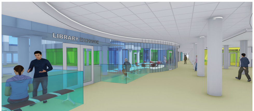
FOX LANE HIGH SCHOOL STUDENT LEARNING EXCHANGE