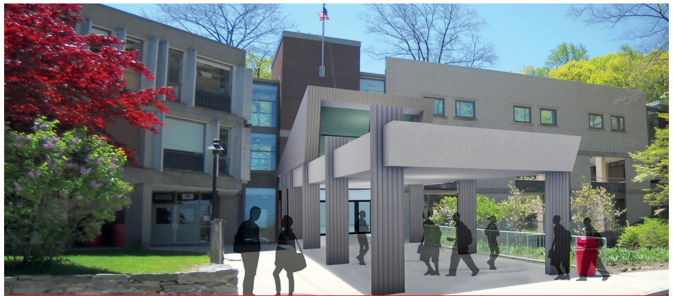
FOX LANE MIDDLE SCHOOL ENTRANCE

PROPOSITION 2 CAN ONLY PASS IF PROPOSITION 1 PASSES