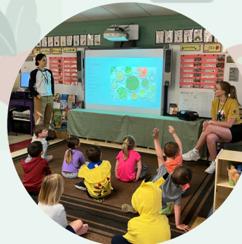
Taste Testing at Taylor Prairie