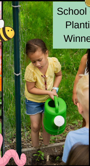
School garden Planting at Winnequah