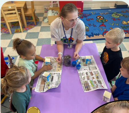
Classroom Seed Planting at Winnequah