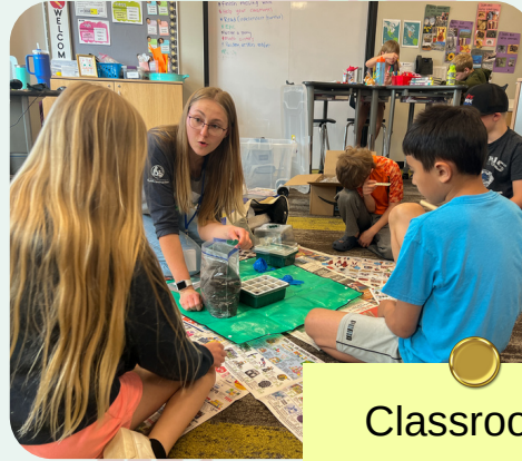
Classroom Seed Planting at Granite Ridge