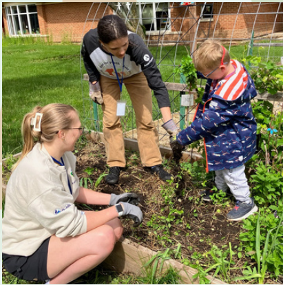
Garden Clean Up & Planting at Taylor Prairie