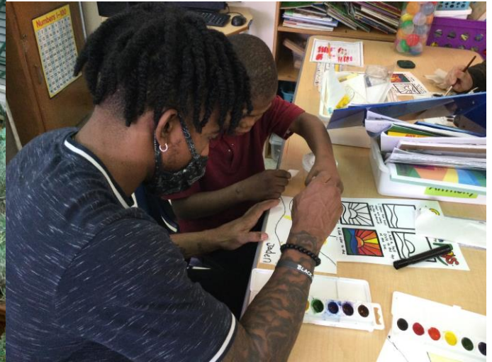
Relationships cannot grow without the proper amount of communication.