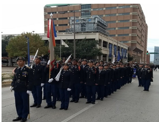
JROTC Battalion leading the Veterans Day Parade in downtown Fort Worth.

Veterans Day weekend was a very busy one for the cadets. On Friday they visited the Veterans Home in Richland Hills and then on Saturday they were chosen over 14 other JROTC schools to lead the Veterans Day Parade downtown Fort Worth. Cadets marched very well and represented POLY EXTREMELY well.