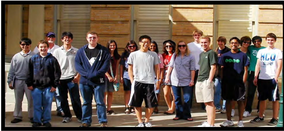
Having fun in San Antonio