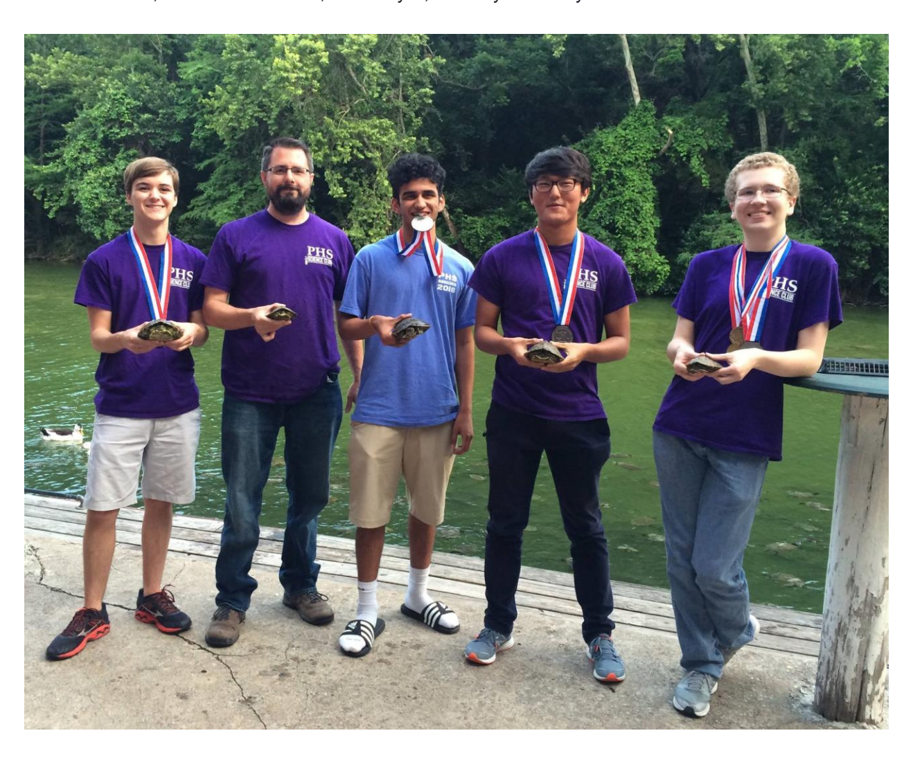
UIL Science Team Wins Region!