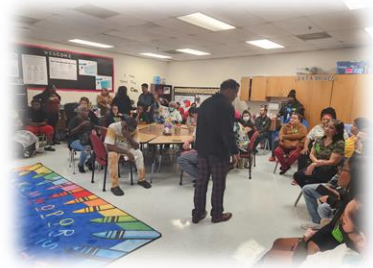
All Pro Dads