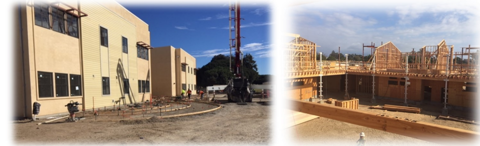
November 2017 Construction Progress at Lemonwood (Left) and Elm (Right)

The Measure R Bond Oversight Committee (Committee) is pleased to report the progress of Measure R projects. Approved by voters in November 2012, Measure R is a $90 million General Obligation (G.O.) bond authorization to replace portable classrooms, relieve student overcrowding by building and equipping new classrooms and educational facilities and repairing and equipping existing classrooms and educational facilities throughout the District. The District has issued all of the Measure R bond authorization.