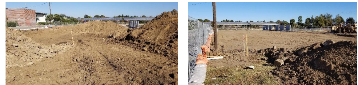
New Marshall Classroom Building Construction Progress - November 2017