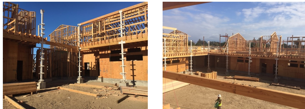
Elm Construction Progress—November 2017

Construction began in February 2017 and is on pace to be completed the second half of the 2018-2019 school year. Four new buildings are planned for the site including two-story classroom wing, kindergarten classrooms, and multipurpose and administration facilities. The new reconstruction school is designed to serve up to 600 students per State standards in grades K-5.