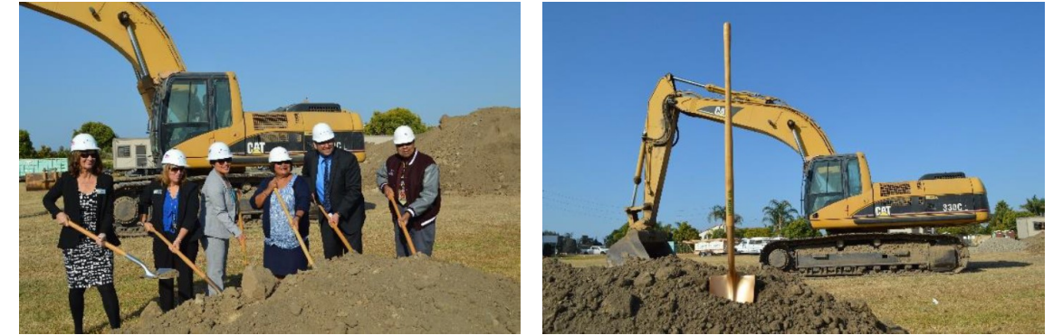
New Marshall Classroom Building Groundbreaking Event - October 2017

Construction efforts commenced in September 2017 towards the development of a new two-story classroom building at Marshall Elementary School. The project has been designed to meet interim 6-8 grade level capacity needs until a new middle school is constructed and to provide Marshall with additional classrooms and a long-term K-8 educational program option. The added building will provide 12 additional permanent classrooms and a redesigned parking area. Construction is scheduled to be completed by September 2018.