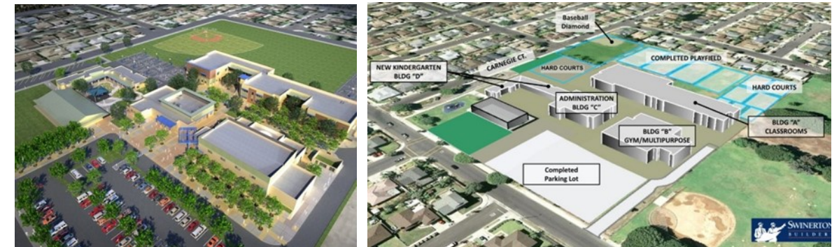
Renderings of Lemonwood Reconstruction

Construction for the new Lemonwood K-8 school is underway. In December 2016, the Board approved a guaranteed maximum price contract for the construction of the Elm campus. A new 12 classroom building at Marshall is in the final stages of Division of State Architect (DSA) review and approval. The new elementary and middle school site at Doris Avenue and Patterson Road has also undergone active negotiation and planning.