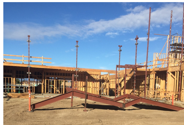
Lemonwood Construction Progress December 2016