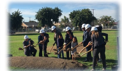
Elm Community Celebration

The Measure R Bond Oversight Committee (Committee) is pleased to report the progress of the Measure R School Facilities Improvement Program. Approved by voters in November 2012, Measure R is a $90 million General Obligation (G.O.) bond authorization to replace portable classrooms, relieve student overcrowding by building and equipping new classrooms and educational facilities and repairing and equipping existing classrooms and educational facilities throughout the District. The District has issued all of the Measure R bond authorization.