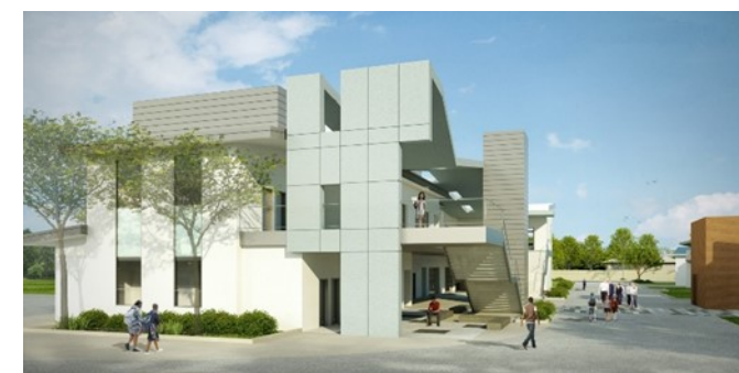
New Marshall Classroom Building Rendering