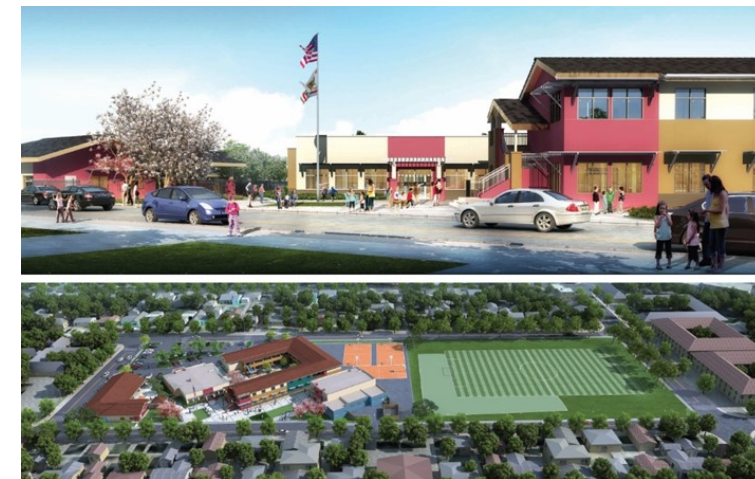
New Elm Campus Renderings