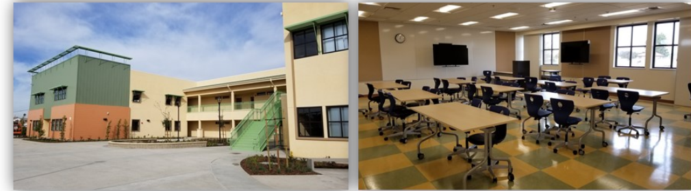
New Lemonwood Elementary School Classroom Building

The Measure R Bond Oversight Committee (Committee) is pleased to present its sixth and final report to the community on the progress of Measure R projects. This report provides a summary of program progress and financial information.