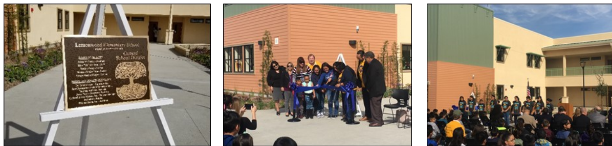
New Lemonwood Elementary School Soft Opening Celebration - March 2018

The first phase of construction is complete and includes the main classroom and multipurpose buildings. This phase of work achieved substantial completion for the new classroom building in January 2018, and for the multi-purpose building in February 2018. Occupation of the new classroom building and multi-purpose building by students and staff occurred as planned in February 2018. In March 2018, the District conducted a "Soft Opening" event celebrating the completion of the first phase of work. The event was well received by the school site and the community. Construction is underway for the second phase and will include new kindergarten and administration buildings, to be completed by April 2019.