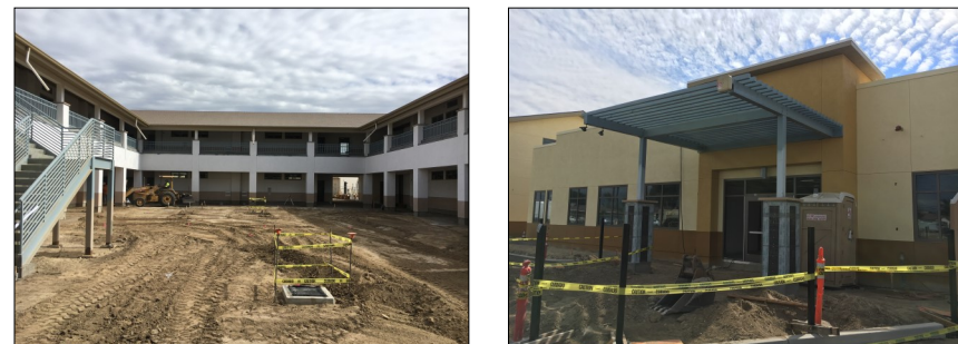
Elm Construction Progress -October 2018

The Elm Reconstruction project includes new two-story classrooms, kindergarten classrooms, and multipurpose and administration facilities. The new school is designed to serve up to 600 students per State standards in grades K-5. Construction began in February 2017 and is planned to be completed over two construction phases, with the first phase of construction scheduled to be completed by December 2018 and the second phase by June 2019.