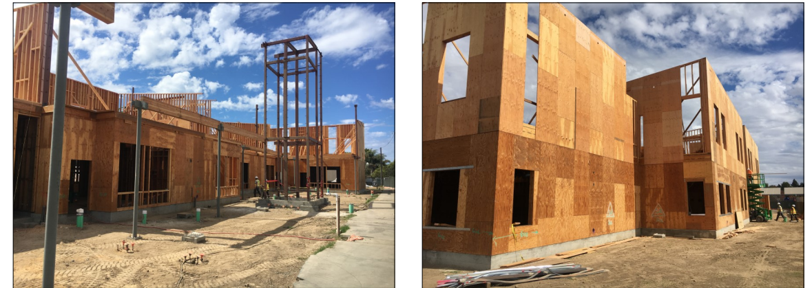
New Marshall Classroom Building Construction Progress - October 2018

A new two-story classroom building is currently under construction at Marshall Elementary School. The building is designed to meet interim 6-8 grade level capacity needs until a new middle school is constructed and to provide Marshall with additional classrooms and a long-term K-8 educational program option. Upon completion, the added building will provide 12 additional permanent classrooms. This building has been carefully designed to match the existing campus on the outside while providing modern, flexible and agile learning environments on the inside. Construction commenced in September 2017 and substantial completion is forecasted for December 2018.