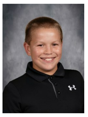
Hall 6th Grade