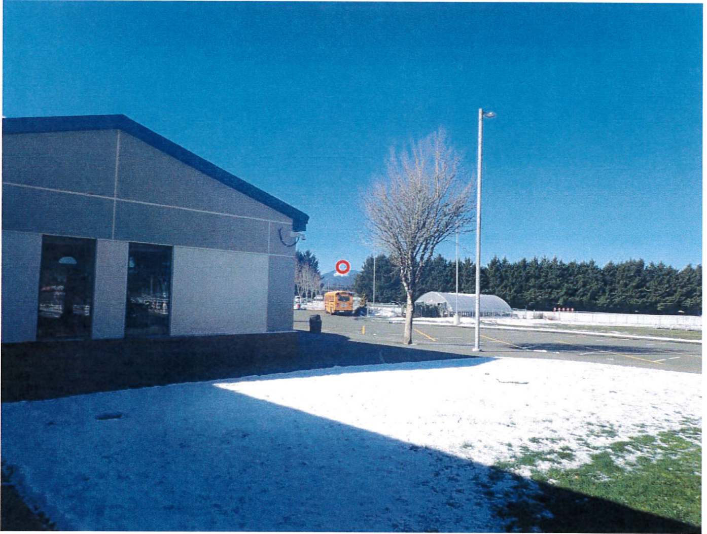
Image 16: Standing underneath the proposed Ubiquiti 5.8 GHz dish location looking west at the Capitol Peak Comms site (circled in red).