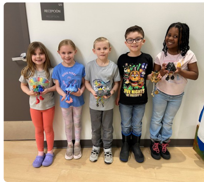
Proud Clay Artists