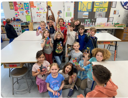
Pinch Pot Art