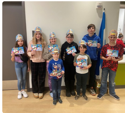
More March Birthdays!!