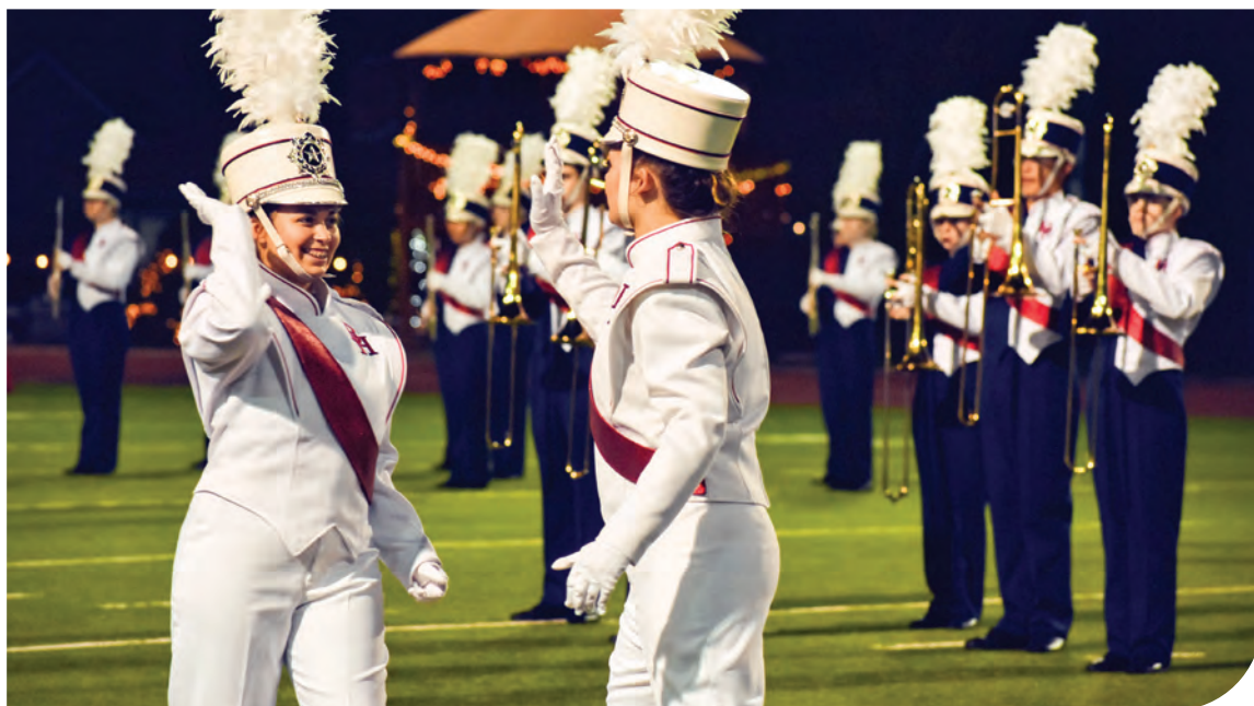
BHHS Marching Band Drum Majors finish their salute prior to the Wolfpack's Finals performance at the Sunset Festival of Bands. Their excellent performance earned them 1st Overall and a season-high score!