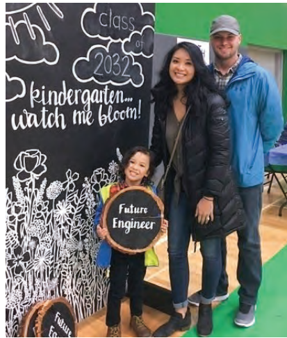
At last year's event, a future East Olympia Elementary Engineer is excited to learn about what it will be like to be in kindergarten.