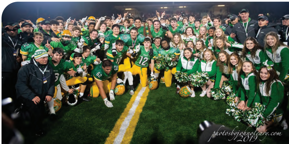
THS football players, coaches and cheerleaders celebrate the WIAA 2A State Football Championship in December where THS football triumphed over the Steilacoom Sentinels 48-34. This victory was the culmination of an UNDEFEATED SEASON!