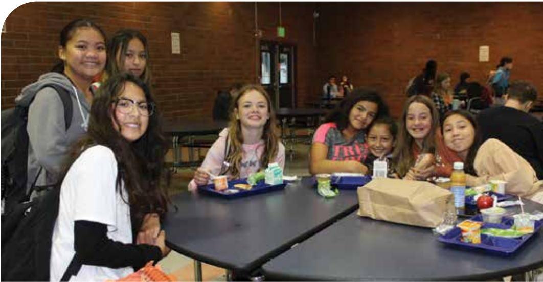
One of the upcoming projects scheduled to take place will strengthen the Tumwater Middle School cafeteria walls to withstand earthquakes.

Thanks to the backing of our supportive Tumwater community, we are able to continue improving and updating our district facilities, providing our students with safe facilities and state-of-the-art technology. The last bond our district voters approved was in 2014 and all of those projects are now complete. Our current projects are funded through the 2020 and 2022 capital levies. These funds allow us to increase safety, make minor building modifications, update technology, provide major preventative maintenance, and energy conservation projects. Upcoming projects include: