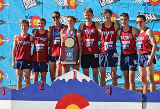
See page 8 for more photos and information.

TCA Marching Band recently garnered the 2A Marching Band State Championship in Grand Junction, CO. This title marks the fourth title overall, and second consecutive championship since first competing in 2015. TCA has finished in the top-3 every year of the competition, including runner-up for the championship in 2019.