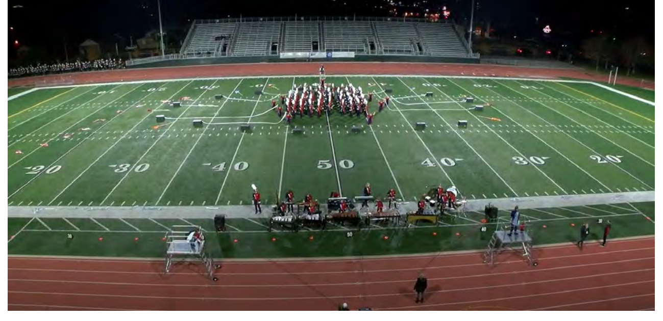
See page 1 for more photos and details on state Marching Band competition; and below for Cross Country competition.