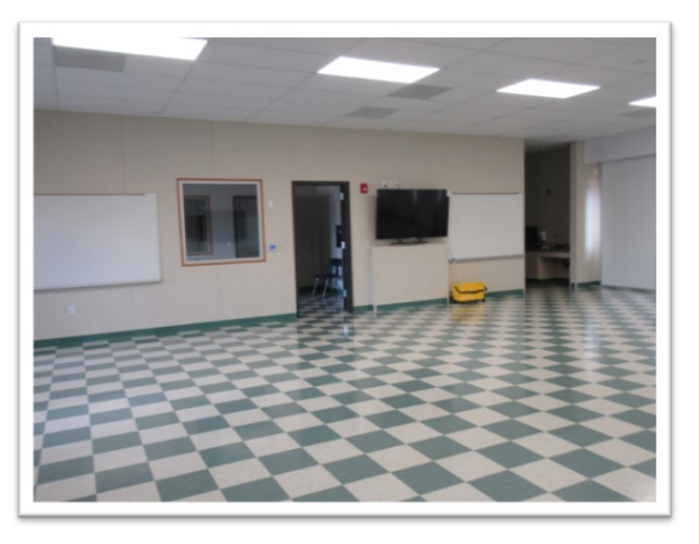
Sample New Kindergarten/Flex Classroom Building - Brekke Elementary School October 2018