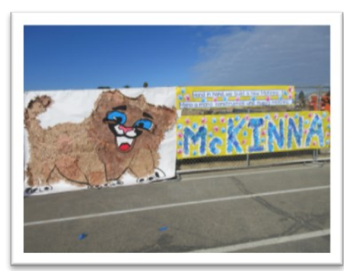
Reconstruction of McKinna School - Groundbreaking Event October 2018