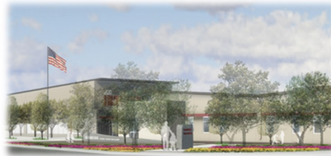
Rose Avenue Elementary School Design Renderings – IBI Group

The Measure D Citizens Bond Oversight Committee (Committee) has been established to actively review and report on the expenditure of voter-approved bonds, receive and review copies of annual performance and financial audits, and present an annual written report.