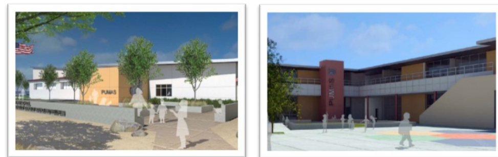
Reconstruction of Rose Avenue School—Design Renderings by IBI Group

The Rose Avenue project consists of a complete reconstruction of the existing 50+ year old campus with entirely new K-5 facilities. New facilities include a two-story classroom building, library, administration space, multipurpose room, playfields, hard courts, and support spaces. All new facilities will be located in the south half of the site along La Puerta Avenue, where playfields currently exist. Upon completion, the north half of the site is to be demolished and replaced with new playgrounds, hard courts, and play fields. The project is currently in design and scheduled to be submitted to the Division of State Architect in April 2018.