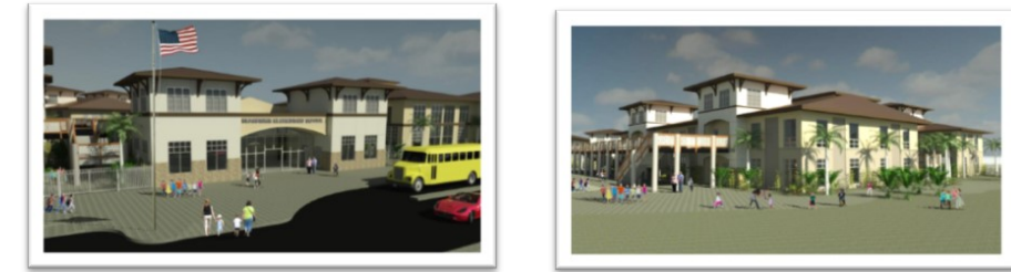
New Seabridge K-5 School—Design Renderings by Flewelling and Moody

The New Seabridge K-5 School consists of a new 630 student elementary school north of Oxnard's Seabridge neighborhood, approved by the California Coastal Commission in March 2013. New facilities include a two-story classroom building, library, administration space, multipurpose room, playfields, hard courts, and support spaces. The new school will cover a 6 acre District owned site and share an adjacent city owned 2.5 acre joint use park area with pathways, parking, and recreational facilities available to the public. The school's multipurpose room is proposed to be open for community use after school hours and the curriculum is proposed to focus on coastal environmental education given the school's location to the ocean. The project is currently in design and scheduled to be submitted to the Division of State Architect in February 2018.