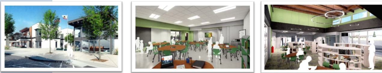
Reconstruction of McKinna School—Design Renderings by Dougherty

New facilities for the McKinna Elementary School Reconstruction project include a two-story classroom building, library, administration space, multipurpose room, playfields, hard courts, and support spaces. The new school is to be constructed in the current play field areas allowing for instruction to continue at the older facility until completion of the replacement school. Once complete, the older structures will be demolished and new play fields and remaining support facilities would be constructed in their place. The project is currently under review by the Division of the State Architect.