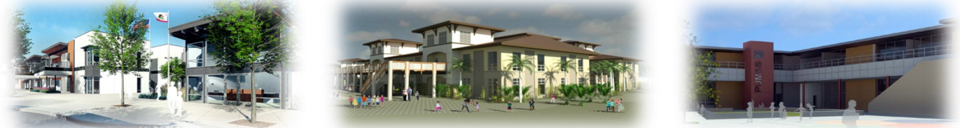
McKinna (Left), Seabridge (Middle), and Rose Avenue (Right) Design Renderings

As required by State Law, a Measure D Bond Oversight Committee (Committee) has been established to actively review and report on the expenditure of voter-approved bonds, receive and review copies of annual performance and financial audits, and present an annual written report.