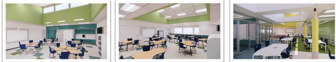
Design Renderings of Ritchen Elementary School Modernization – Arcadis (Formerly IBI Group)

The Measure D and Measure I Bond Oversight Committee (Committee) has been established to actively review and report on the expenditure of voter-approved bond proceeds, receive and review copies of annual performance and financial audits, and present an annual written report.