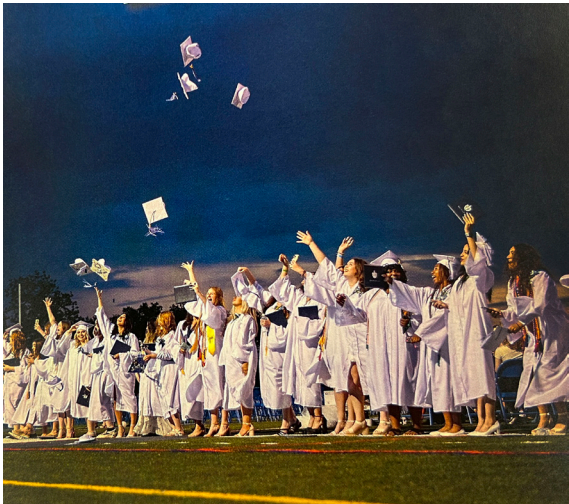
PVHS 2023 Graduation