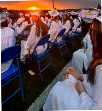
PVHS 2023 Graduation