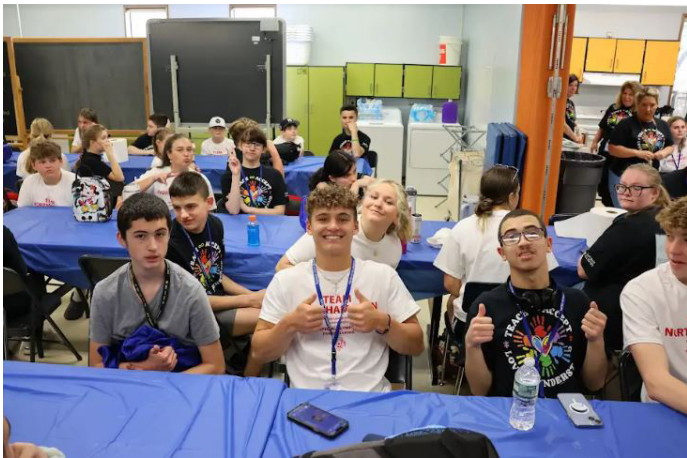
Special Olympics Breakfast

You can find a video of the event on ABC's local news station WNEP's YouTube channel.