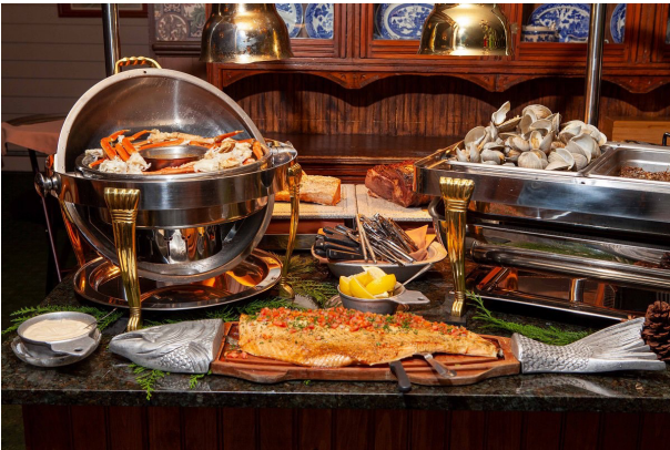
Stroudsmoor Buffet