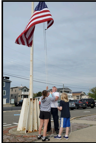
Students participate in raising and lowering the American Flag daily at the Long Beach Island Grade School

We would like to thank our PTA for their continued support. Thank you to all of the parents and teachers for their time and effort! We are looking forward to the many learning activities planned. Please make sure to sign up to become a member of the PTA. Special thanks to our PTA for all of their hard work, especially at the PTA meetings...many thanks to all for a job well done!