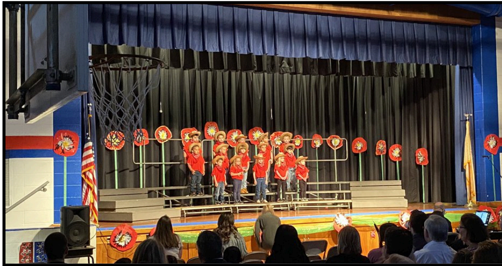
EJ Spring Show- How Does Your Garden Grow? is underway.

In math, we are doing a countdown to the end of the school year. Every day is a number of how many days are left. We are using this special number- and seeing how it looks as a word, ten frames, and tally marks. We are also using our knowledge of counting forward and trying to count backwards!