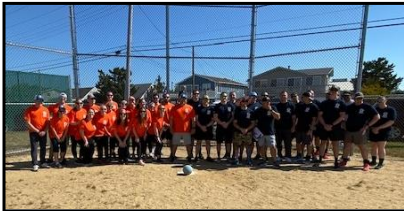
Participants of our first annual Books Versus Badges Kickball Game 2024.